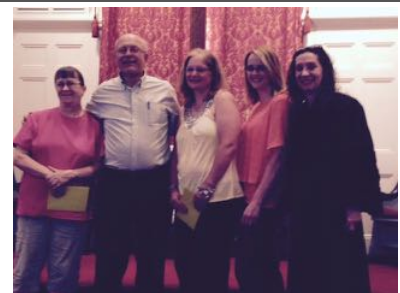
Sunday School Teachers are thanked for their faith-sharing on Sunday School Teacher Appreciation Sunday.