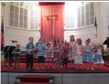
Sunday School students sing of their faith on Youth and Children Sunday.